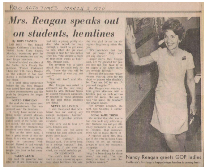
1970 – Nancy Reagan Visit Palo Alto Times, March 3, 1979