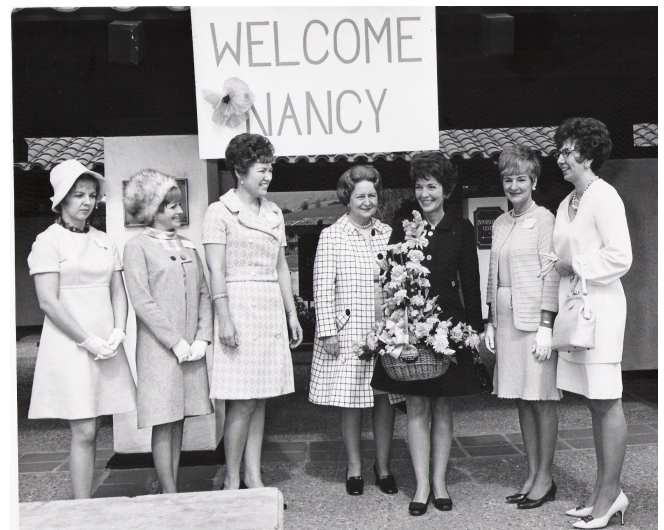
1970 – Nancy Reagan visits with Sunnyvale RWF members